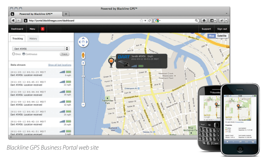
Business Portal mobile site